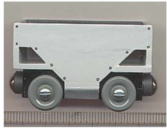
'99 Gray Hopper car