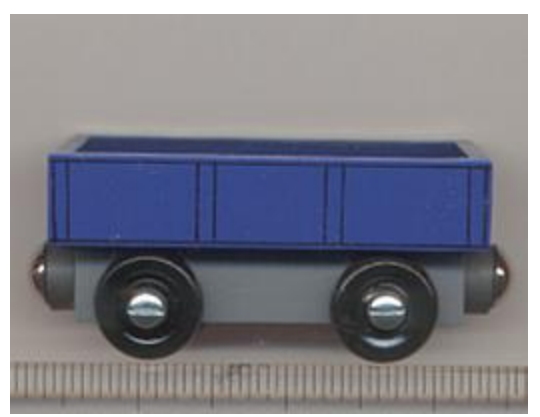
'99 Blue Gondola

Another addition for 1999 was a a slightly larger version (3 1/2" long), with a fancier frame design (two 1" blocks of frame stock with a piece of 1/4" x 1/2" in between). This was for the "Level 2" freight train.