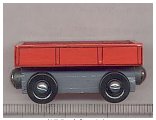
'97 Red Gondola

Gondolas are some of the simplest and oldest freight cars. Basically a flat car with raised sides, they can carry a variety of cargoes, and are frequently seen hauling scrap iron. Wooden train gondolas are some of the most useful cars, since they can carry everything from green plastic army men to tiny teddy bears.