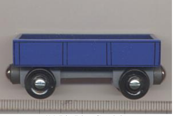
'99 Big Blue Gondola